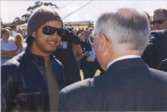
Australian Idol star, Guy Sebastian, and his parents were there to greet the Prime Minister