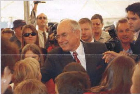
Students from Pooraka Primary School meet the Prime Minister