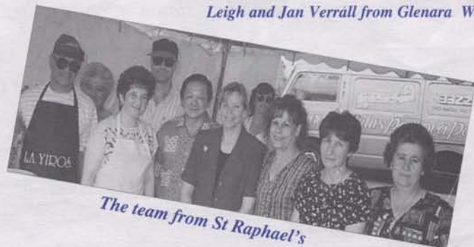
The team from St Raphael's