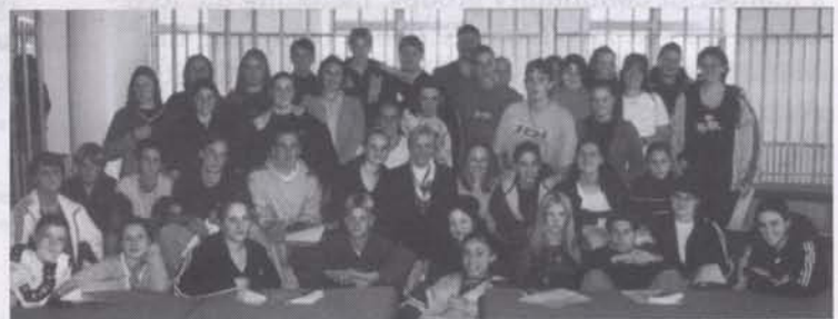
Students from The Heights School (left) and Banksia Park High School (right) visited Parliament House, Canberra